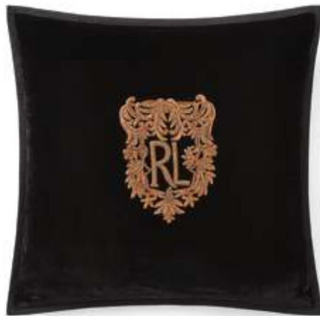
GLENSHIRE THROW PILLOW

EMBROIDERED BULLION AT THE FRONT. SOLID VELVET REVERSE. SHELL: 100% COTTON. INSERT: 100% FEATHERS