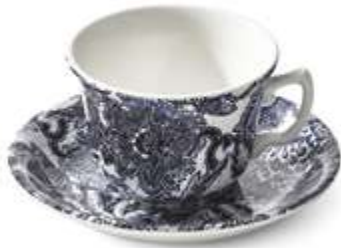
TEA CUP & SAUCER

ITEM 680753284001 / UPC 886087364071 8.6"