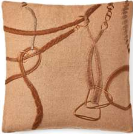
EQUESTRIAN KNIT THROW PILLOW

ITEM 650802767001 / UPC 886087400380 20" x 20"