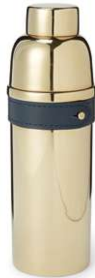
COCKTAIL SHAKER ITEM 680774815001 / UPC 886087388213 3.2" X 3.2" X 9.4"