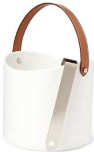
ICE BUCKET AND TONGS

ITEM 680774819002 / UPC 886087392241 6.37" X 6.37" X 6.53"