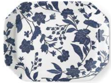
LARGE RECTANGULAR PLATTER

ITEM 680753297001 / UPC 886087364316 9.187" X 1.7"