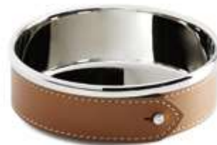
BOTTLE COASTER ITEM 680673977001 / UPC 886087307696 5.11" X 5.11" X 1.57"