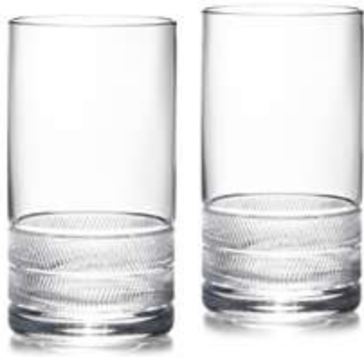
HIGHBALL - SET OF TWO

ITEM 680858707001 / UPC 886087420418 3.15" X 5.9"H / 80MM X 150MM