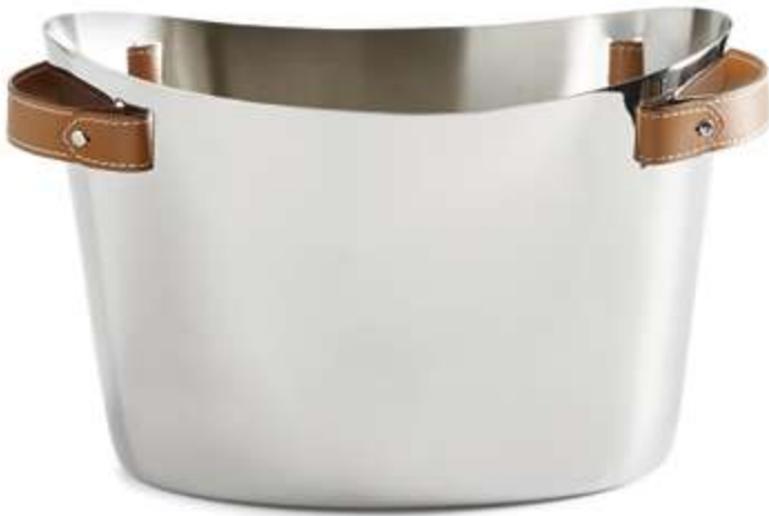
DOUBLE CHAMPAGNE COOLER ITEM 680670062001 / UPC 886087307641 11'3" X 9'1" X 7'4"