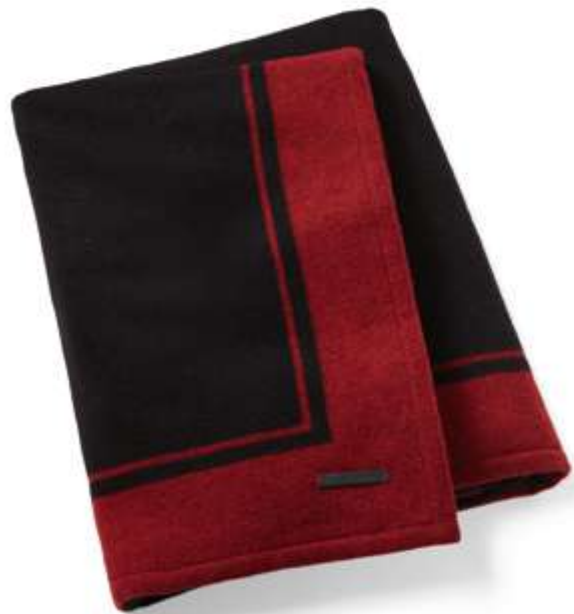
THROW BLANKET ITEM 650912846001