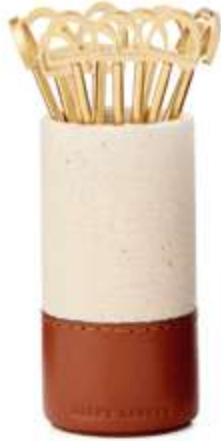
COCKTAIL PICKS & HOLDER

ITEM 680758790002 / UPC 886087371062 1.6" X 3.3"