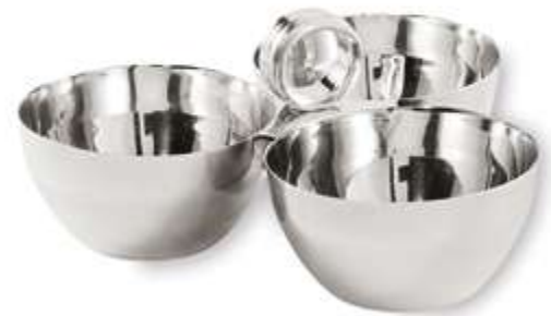
TRIPLE NUT BOWL

LARGE: ITEM 680703227001 / UPC 886087335644 4.76" X 2.99" MEDIUM: ITEM 680703228001 / UPC 886087335651 4.10" X 2.48"