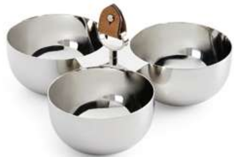
TRIPLE NUT BOWL ITEM 680673976001 / UPC 886087307689 4.52" X 4.52" X 2.36"