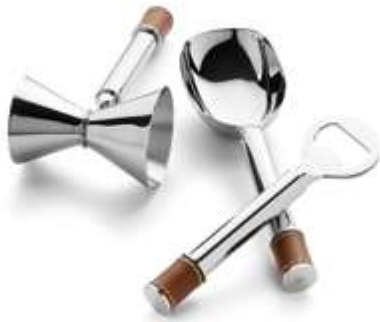
BAR TOOLS ITEM 680673980001 / UPC 886087307726 SCOOP: 2.36" X 4.3" X 1.2" JIGGER: 3.15" X 7.1" X 2.2" OPENER: 1.6" X 2.6" X 0.7"