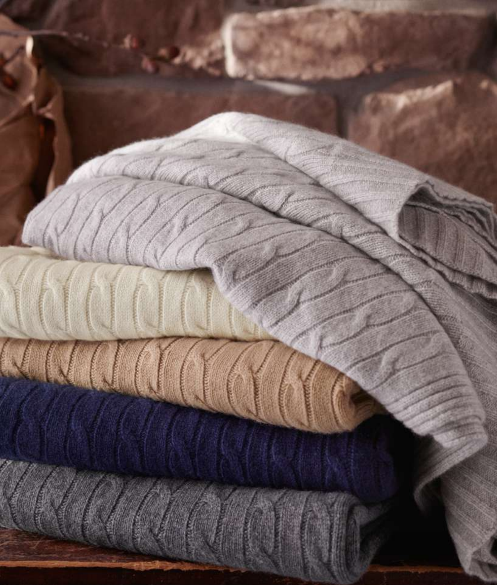
CABLE CASHMERE COLLECTION