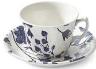
TEA CUP & SAUCER

ITEM 680753298001 / UPC 886087364330 4.88" X 3.44" X 3.625" / 12.6 OZA