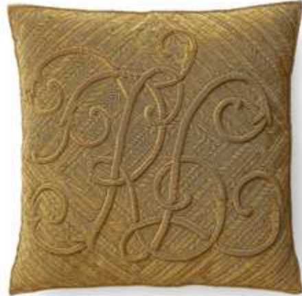
RYCROFT THROW PILLOW

SHELL: WOOL, SILK, CASHMERE. INSERT: 100% FEATHERS