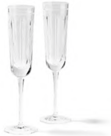
CHAMPAGNE FLUTE - SET OF TWO

ITEM 680842695001 / UPC 886087419962 269MM X 117 MM, 1150 ML / 10.5" H X 4.6" D