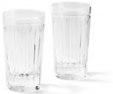
HIGHBALL - SET OF TWO

ITEM 680842696001 / UPC 886087419979 254MM X 57MM, 170 ML / 10" H X 2.25" D