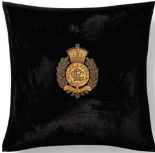
THROW PILLOW ITEM 650912835001