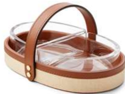
DOUBLE NUT BOWL

ITEM 680785192001 / UPC 886087383553 7.2" X 11.2"