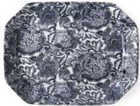
LARGE RECTANGULAR PLATTER

ITEM 680753287001 / UPC 886087364132 9.187" X 1.75"