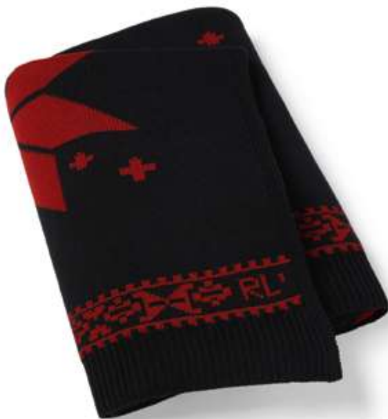
THROW BLANKET ITEM 650912849001