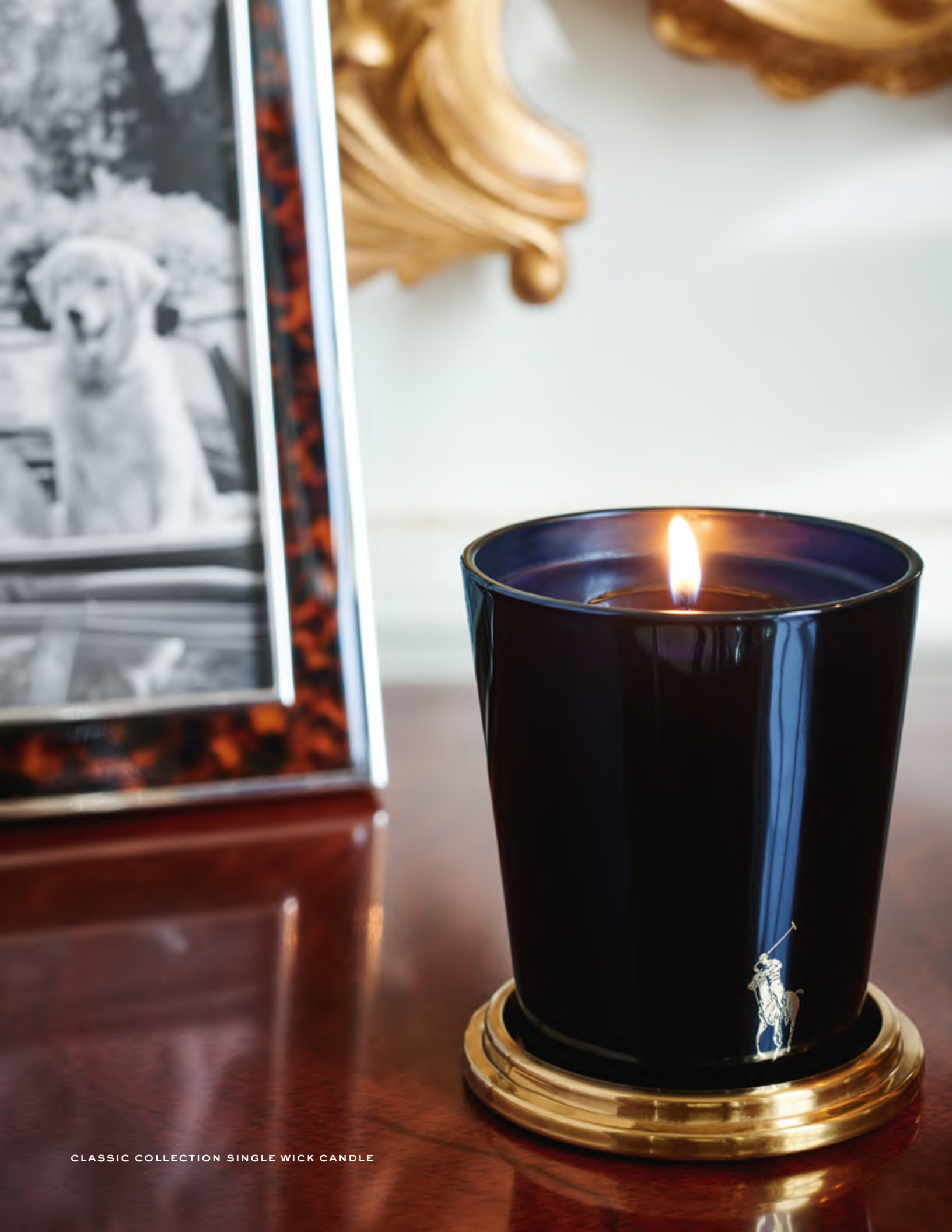
CLASSIC COLLECTION SINGLE WICK CANDLE