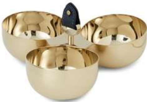
TRIPLE NUT BOWL

ITEM 680774811001 / UPC 886087388190 18" X 11.4" X 0.5"