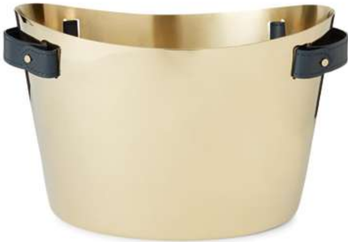
DOUBLE CHAMPAGNE COOLER ITEM 680774817001 / UPC 886087388237 11'3" X 9'1" X 7'4"