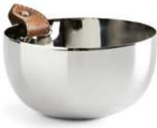
NUT BOWL ITEM 680673978001 / UPC 886087307702 7.67" X 7.67" X 1.81"