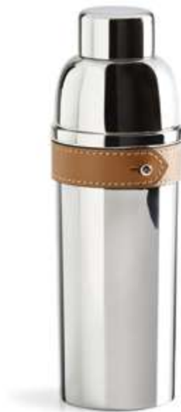
COCKTAIL SHAKER ITEM 680673975001 / UPC 886087307672 3.07" X 3.07" X 1.29"