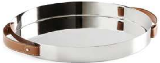
ROUND TRAY ITEM 680670063001 / UPC 886087307658 13.77" X 13.77" X 1.8"