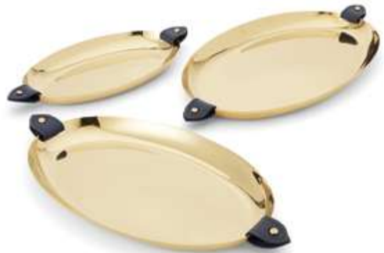
NESTING TRAYS - SET OF THREE

ITEM 680774814001 / UPC 886087388206 8.2" X 7.4" X 3.4"