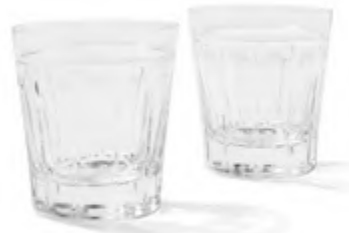
DOF - SET OF TWO

ITEM 680842694001 / UPC 886087419955 135MM X 78MM / 5.3" H X 3" D