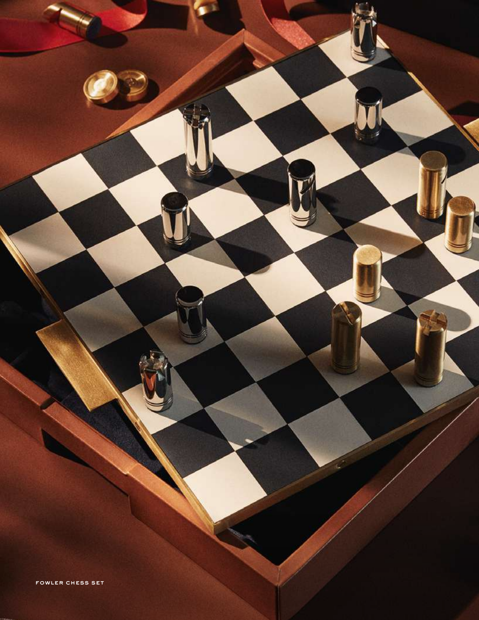
FOWLER CHESS SET