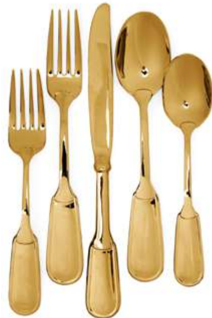
FIVE PIECE PLACE SETTING