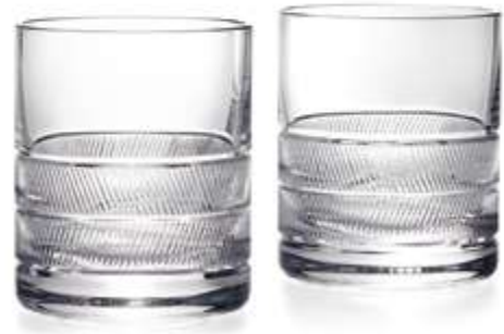
DOF - SET OF TWO

ITEM 680858707001 / UPC 886087420418 3.15" X 5.9"H / 80MM X 150MM