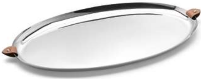
OVAL SERVING TRAY ITEM 680695036001 / UPC 886087317961 16" X 9.625" X .69"