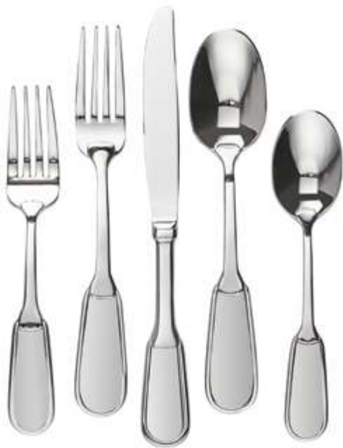
FIVE PIECE PLACE SETTING